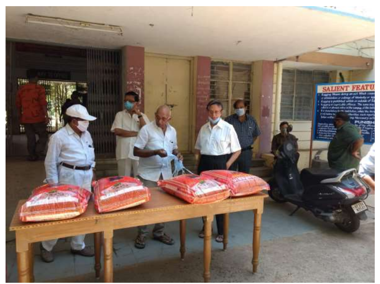
The President and members of PRGC Alumni Association distributing 25 Kg rice bags to the people in the neighbourhood