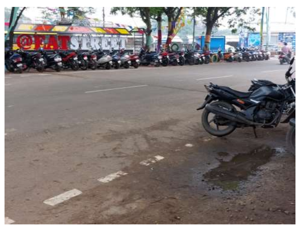
Vehicles parked outside the college on "VEHICLE FREE DAY"