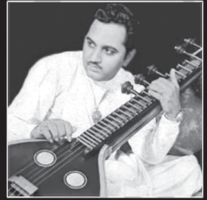
Chittibabu (Veena Maestro)