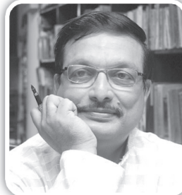
Sri Yendamuri Veerendranath Writer & Motivator