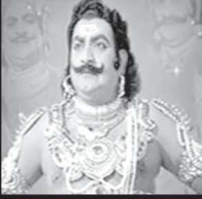
S.V. Rangarao (Actor)