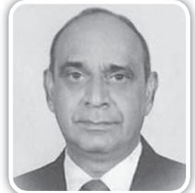
Dr. M.S. Sanjeeva Rao Former Union Minister