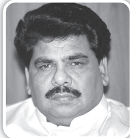
Sri G.M.C. Balayogi Former Loksabha Speaker