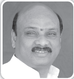
Sri Ch. Ayyannapatrudu Hon'ble Minister Panchayathi Raj, Govt. of A.P