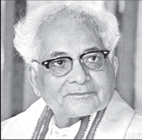
Devulapalli Krishnasastri (Lyricist/Writer)