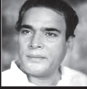
Rao Gopala Rao (Actor)