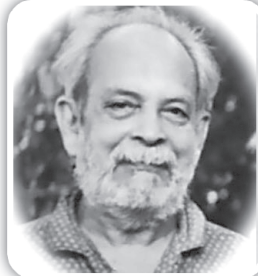
Sri G.V. Chalam Writer & Thinker