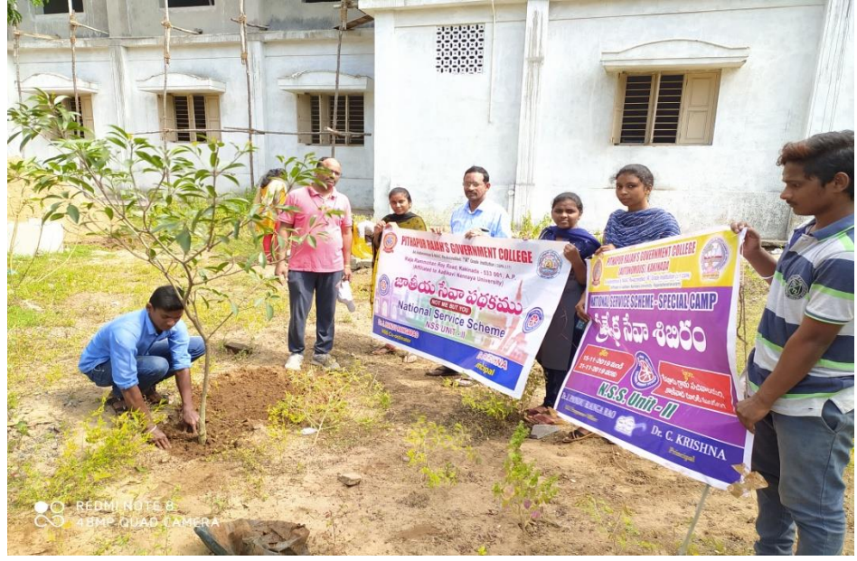
DAY FOUR ACTIVITIES: SWATCHA BHARATH & PLANTATION on 17-11-19